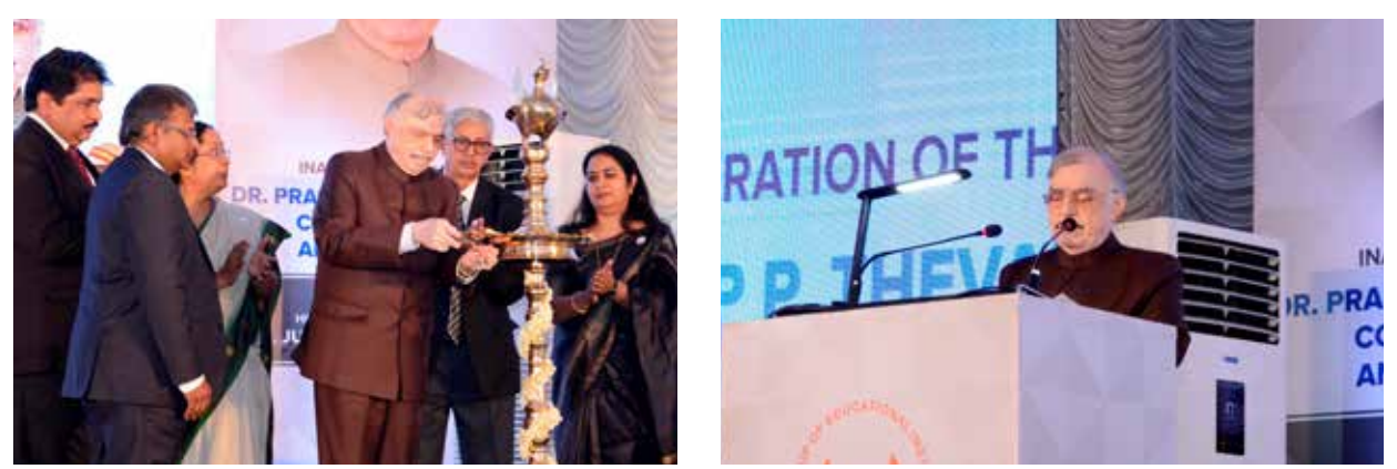
Inaugural lecture by Hon'ble Governor of Kerala Shri Justice (Retd) P Sathasivam