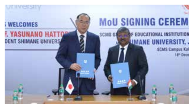
MOU with Shimane University Japan