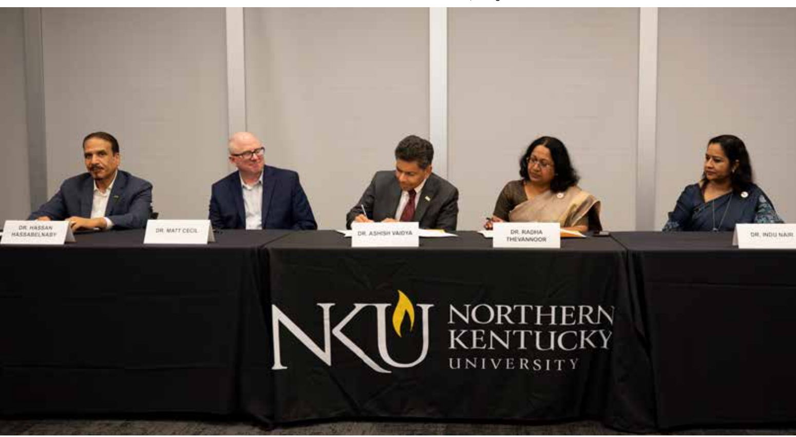
MOU Signing – Daffodil International University, Dhaka, Bangladesh

MoU Signing with Northern Kentucky University, USA