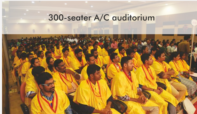
300-seater A/C auditorium