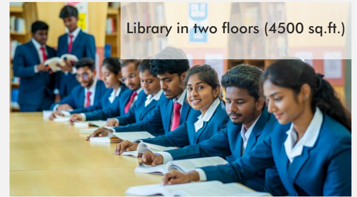
Library in two floors (4500 sq.ft.)