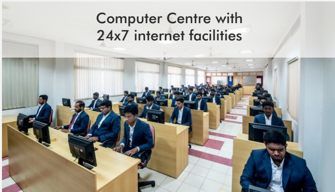
Computer Centre with 24x7 internet facilities