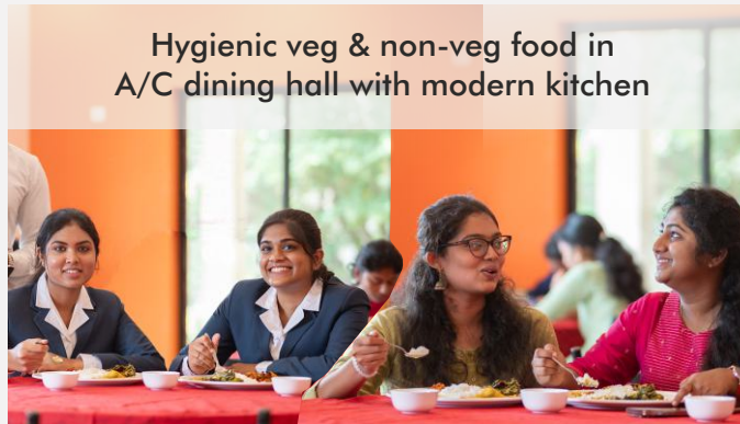
Hygienic veg & non-veg food in A/C dining hall with modern kitchen