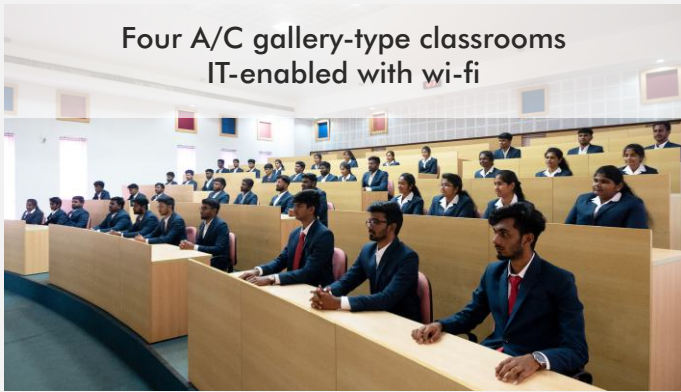
Four A/C gallery-type classrooms IT-enabled with wi-fi