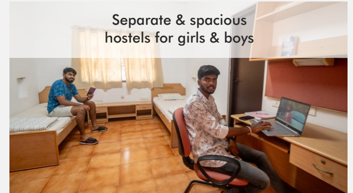
Separate & spacious hostels for girls & boys