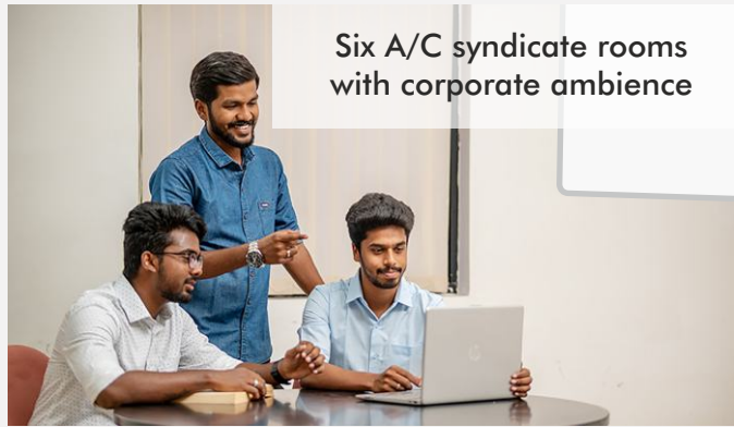
Six A/C syndicate rooms with corporate ambience