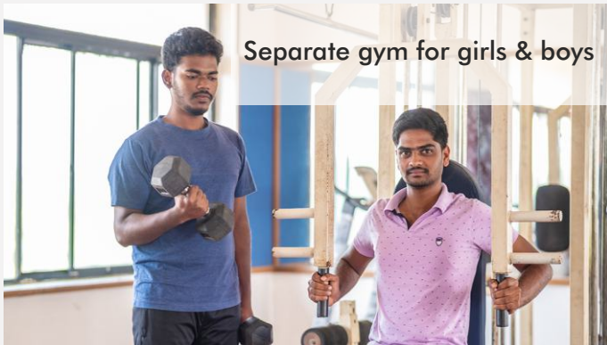
Separate gym for girls & boys