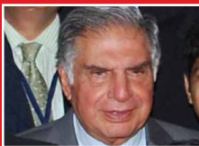
Mr. Ratan Tata Renowned Industrialist