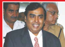
Mr. Mukesh Ambani Chairman & MD, Reliance